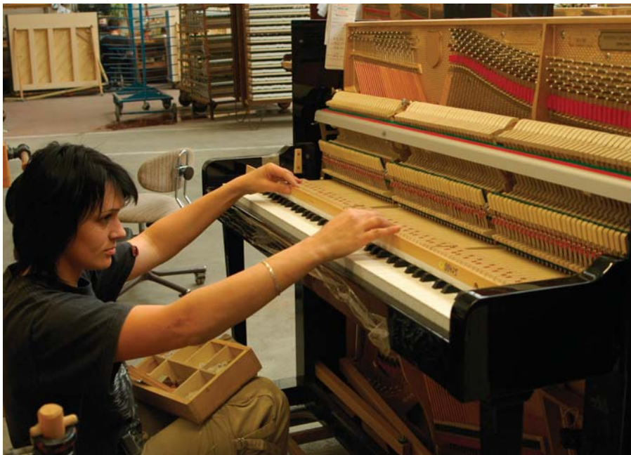
Fine regulation is one of the signatures of Petrof pianos.