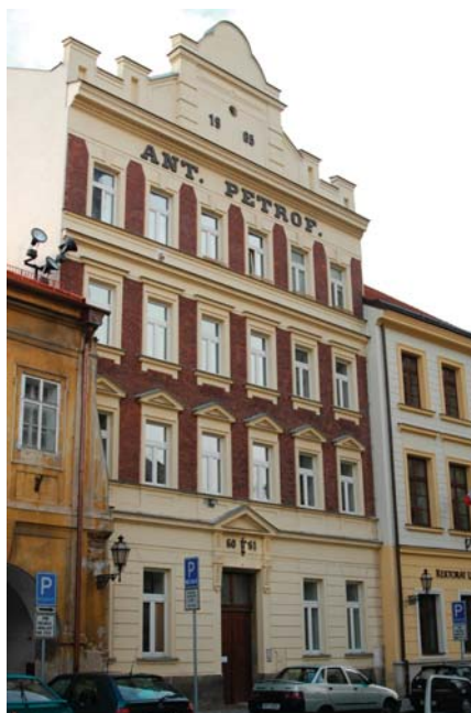
The original Petrof factory, now a landmark in Hradec Králové.

Over the last decade, the liberalized Czech economy has grown at a fast pace; it even boasts one of the world's rare expanding piano markets. However, the resulting appreciation of the Czech currency has blunted the